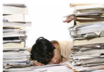
Scanning paper charts